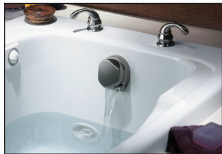
A water softener system with a Fleck 7000 valve meets water demands of newer and larger homes.