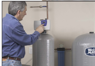
Installing a water softener system with a Fleck 7000 valve delivers the highest flow rates available in a residential system.

and 1.25 inch pipes, the 7000 high flow rate control valve delivers a continuous flow of 25 GPM to 35 GPM (with optional piston) at 15 psi drop. That makes it the softener of choice for new housing where more plumbing fixtures can create a bigger demand for water. What's more, the 7000 valve features the highest backwash flow rate. That means higher efficiency and performance, especially for filter applications.